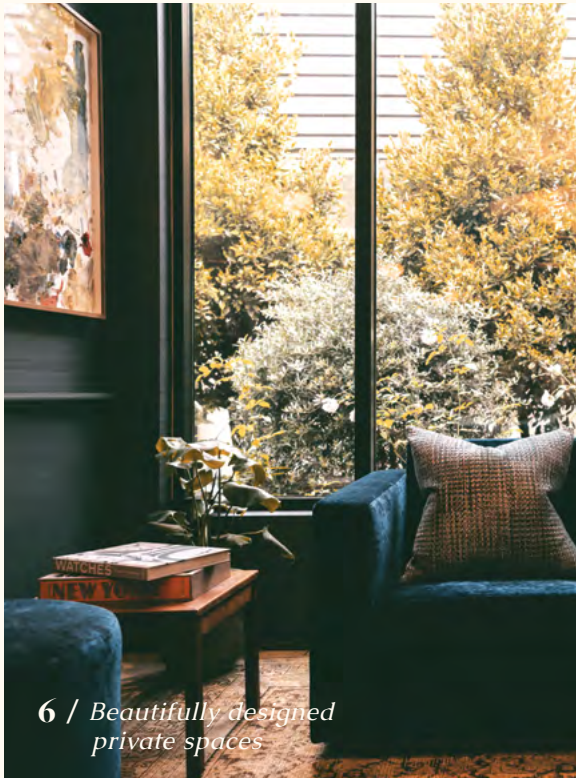
6 / Beautifully designed private spaces